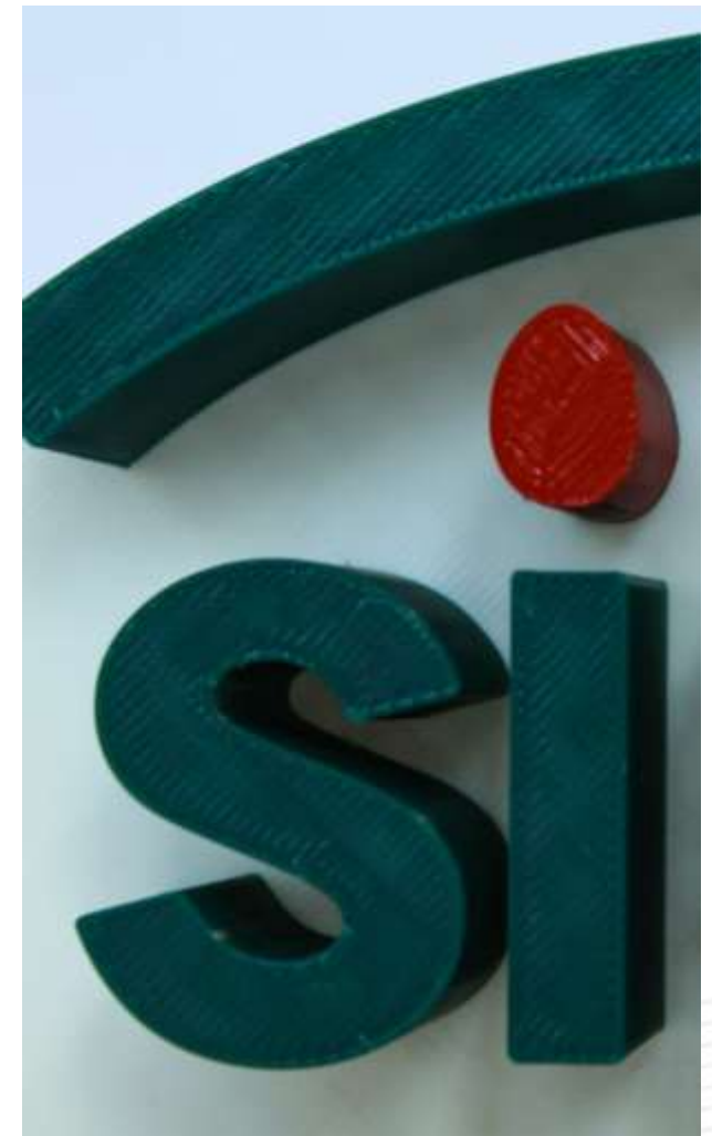
DETALLE DE ACABADO DEL TROFEO